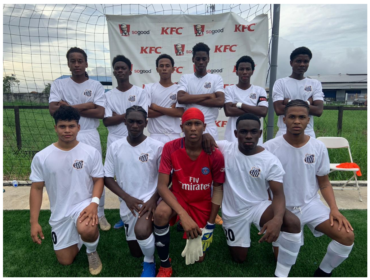
Santos FC – National Champions

The National Play-off was conducted over the period June 15 - July 7, 2019 at NTC, Providence. RMA winners and second place clubs were invited to the play-off, with the exception of the EC/P FA, RFA and Bar. FA, where only the winning clubs were invited because of the exorbitant transportation cost to bring both clubs to Georgetown.