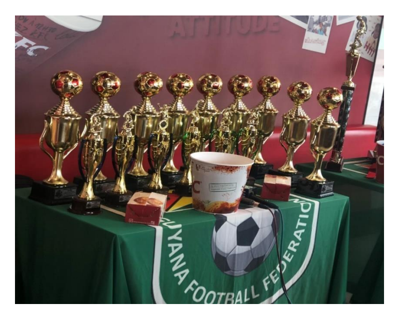
Trophies for the Intra-Association Phase

This phase was then followed by the National Play-off at the National Training Centre, featuring all of the RMA champion clubs.