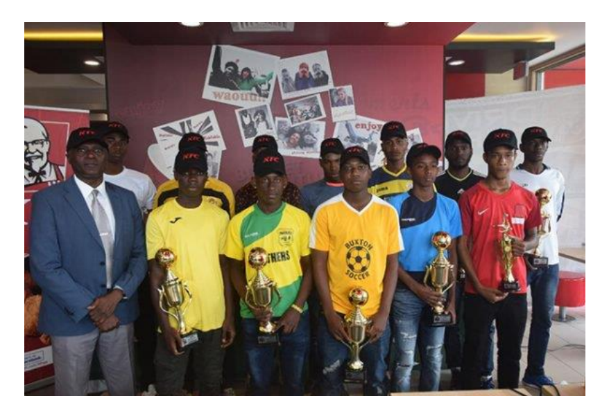
By <u>Stabroek News</u>, June 12, 2019

Following the conclusion of the respective intra-association zones, the Guyana Football Federation [GFF] conducted the official random draw yesterday for the National Championship leg of the KFC Independence U20 Club Knockout Football Cup.