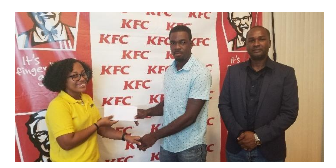
Dynamics FC Coach receiving Second Prize Cheque