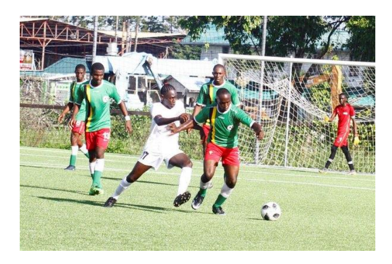
By <u>Stabroek News</u>, July 8, 2019

Santos was crowned the inaugural KFC National U20 football champions defeating Dynamic 3-1 in the final yesterday at the National Training Centre, Providence.